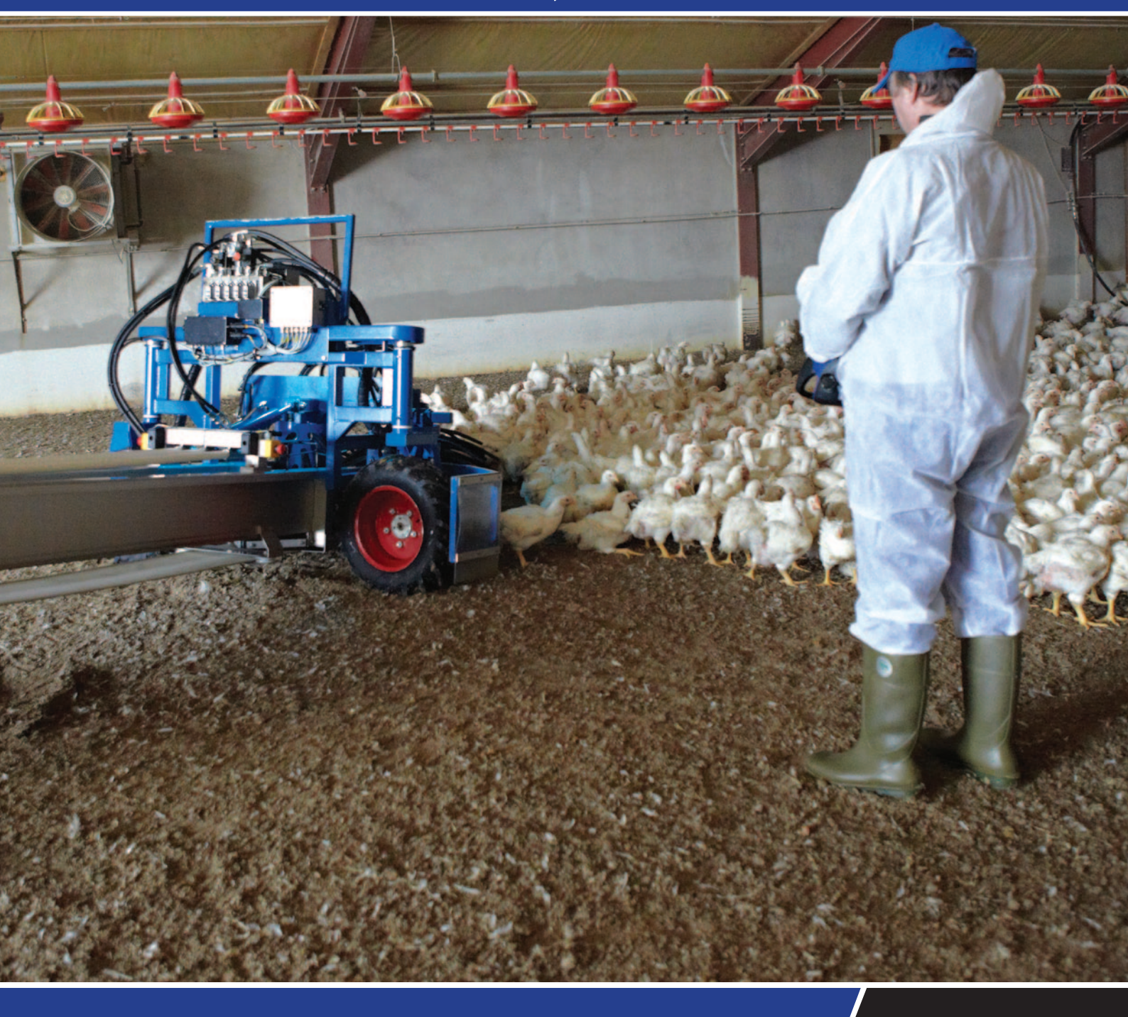
FAST AND EFFECTIVE WORK PROCESS