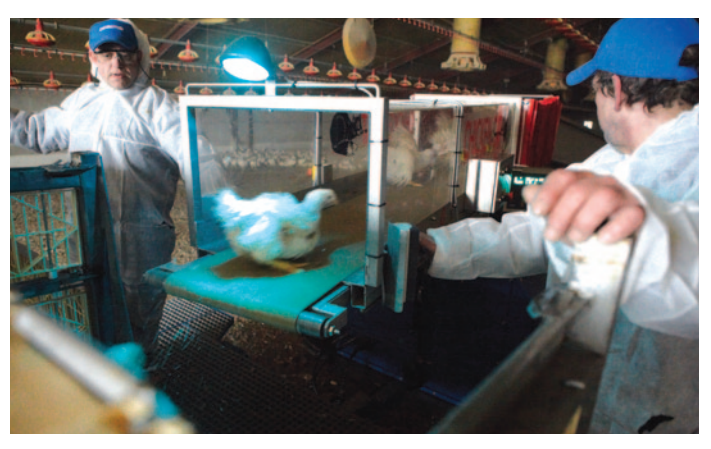
Two people control the proper filling of the containers.