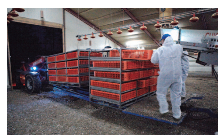
Rotating platform on trailer.